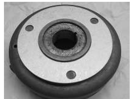
Shim plate on flywheel (Picture 2)