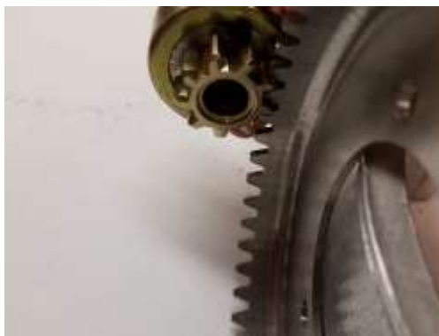
FIGURE 5 (2 OF 2)

**GPL HEAVY DUTY STARTER LIMITED NINE MONTH WARRANTY** If warranty security tag is removed from starter then warranty is void.